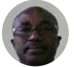
Insa Bamba Africa, Ivory Coast